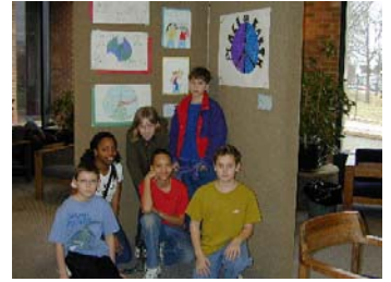
Davey students display their art work for the KSU Peace Conference.