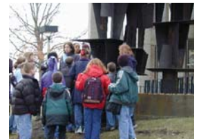
Students visit KSU May 4th Memorial

Much activity has surrounded the Ameritech Classroom with the filming of students and teachers for the RCET CD that is scheduled for completion later this spring. The purpose of the CD is to highlight key research about technology teaching and learning; to illustrate what it looks like in a real classroom; to provide staff development activities for classroom teachers and for college students preparing to be teachers. Many thanks to our partners at Roosevelt High School as well as Davey and Shalersville Elementary. Without the cooperation and contributions of the excellent teachers and their energetic students, a CD of this nature would not be as meaningful to the teachers and professors who will use it.