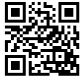
5b. City Tavern or call 267-519-4295 #19