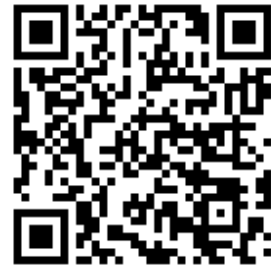
4. Carpenters' Hall or call 267-519-4295 #24