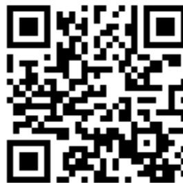
13. Underground Museum (Glass Armonica)

14. Franklin House call 267-519-4295 #22