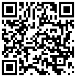
11. 318 Market Street