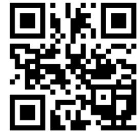
10. Print Shop